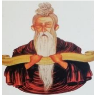
Sethmedura Herbal (Pvt.) Ltd

Siyarata Ayurvedic Private Ltd H3 Building, industrial development board, Pallekele.